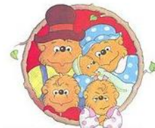
The Berenstain Bears