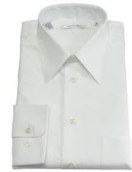
LS Oxford with Cushman Logo WHITE