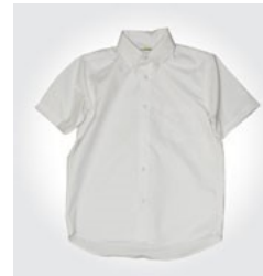
SS Oxford with Cushman Logo WHITE