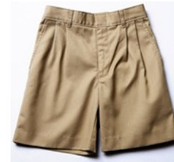
Bermuda Shorts KHAKI