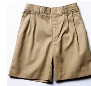
Bermuda Shorts KHAKI