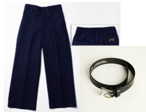
Pants with Belt Loops NAVY