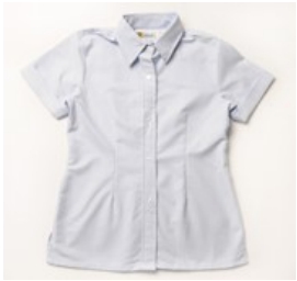
Blouse with Cushman Logo WHITE