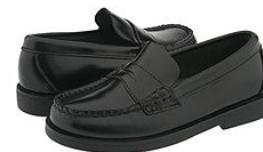
Example of Appropriate Dress Shoes