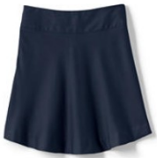
Skirt Mock Wrap NAVY