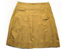
Skirt Mock Wrap KHAKI