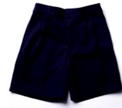
Bermuda Shorts NAVY