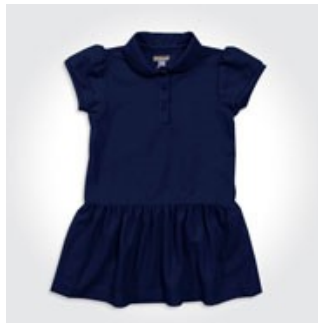
Girls' Polo Style Dress