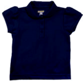
Blouse with Puff Cap Sleeve with Cushman Logo