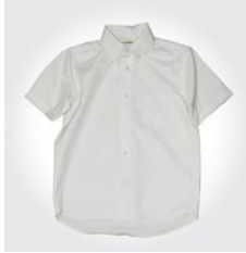
Button Down Oxford with Cushman Logo