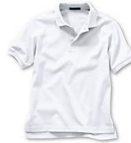
Polo with Cushman Logo WHITE Short Sleeve or Long Sleeve * MUST BE TUCKED IN*