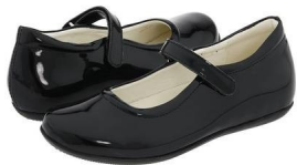
Example of Appropriate Dress Shoes