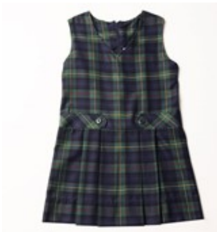
Shift Jumper with Logo HUNTER/CLASSIC NAVY PLAID