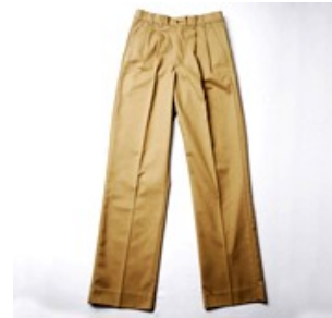
Pleated Pants KHAKI