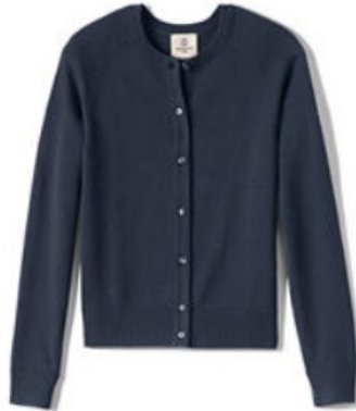
Button Up Cardigan