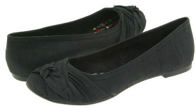
Example of Appropriate Dress Shoes