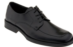
Example of Appropriate Dress Shoes