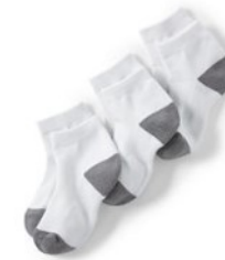
White Ankle Socks