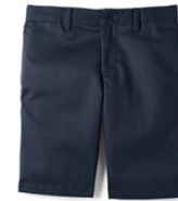
Bermuda Shorts KHAKI/NAVY