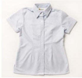
Button Down Oxford with Cushman Logo