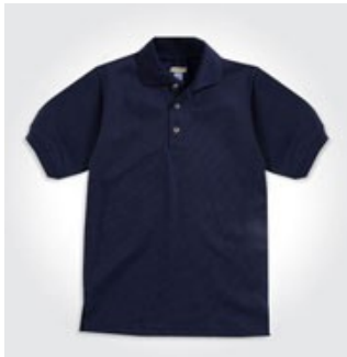
Short Sleeve Polo with Cushman Logo

NAVY, WHITE, ICE PINK, DEEP PURPLE, COBALT, RED OR LIGHT BLUE