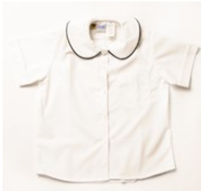
Cushman Blouse (Peter Pan Collar)