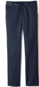
Slacks KHAKI /NAVY