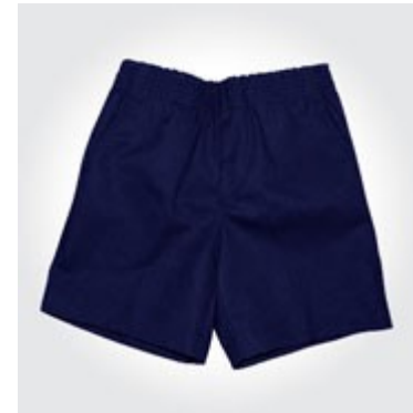
Full Elastic Waist Shorts-NAVY