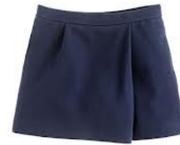
Girls' Pull On Elastic Waist Skort