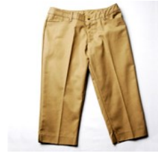
Capri Slacks KHAKI