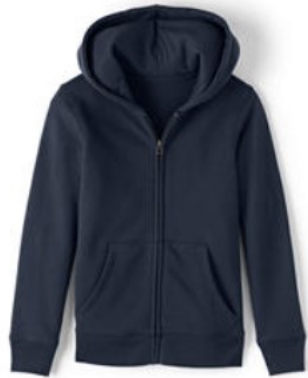
Zippered Hoodie Sweatshirt