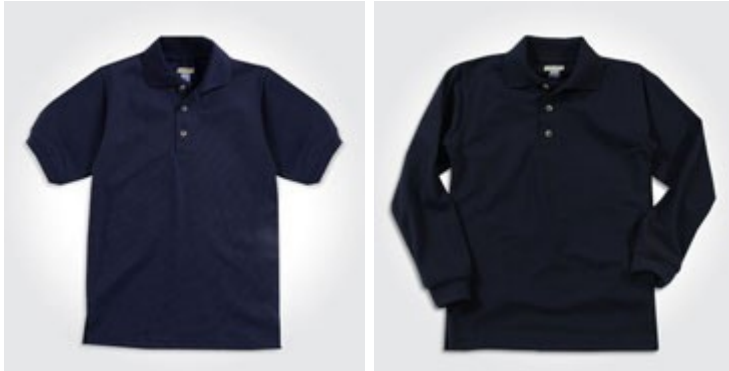
Polo with Cushman Logo NAVY, PINK, LIGHT BLUE OR WHITE