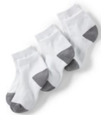
White Ankle Socks